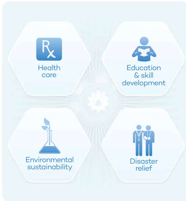
CSR Obligations [₹ million]